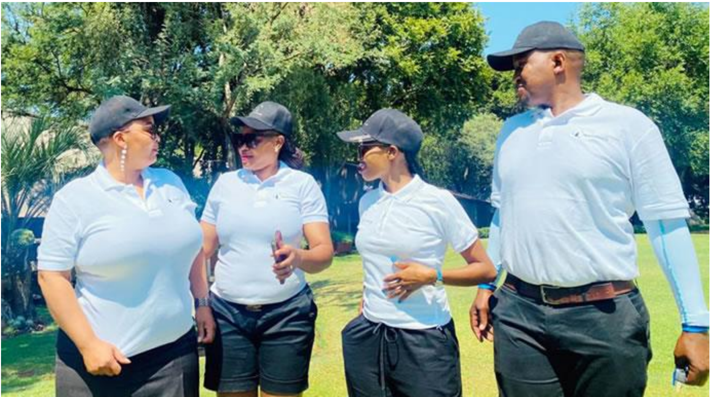
Techenomics Botswana was represented at the inaugural Mogale Golf Classic.

It does so by lowering operating temperatures of lubricants thus reducing friction, minimising engine and component wear, increasing lubricant life, decreasing fuel consumption and limiting harmful emissions. Wame is not only spreading the word to mining and industry in Botswana, she is also doing so throughout southern Africa.