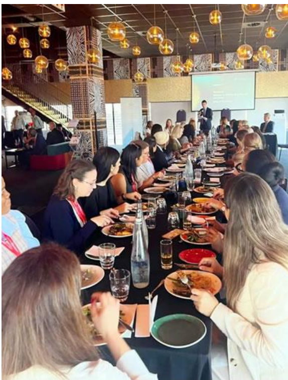
The women in mining session at the Australian Mining in Africa event in Cape Town.

The roundtable discussed progress being made in achieving gender equality and various ways that this process can gather momentum. During the session, Wame learned that an important first step in this process was addressing gender-based discrimination prior to entry into the labour market.