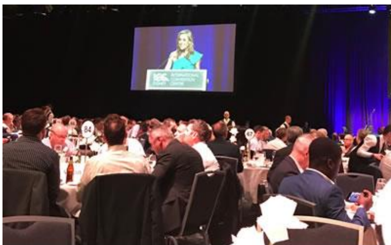
IMARC 2022 included conference sessions over the three days.

“This means that Techenomics’ total fluid management services aimed at optimising the effectiveness of oil, fuel and all lubricants will continue to be just as relevant as they are today.